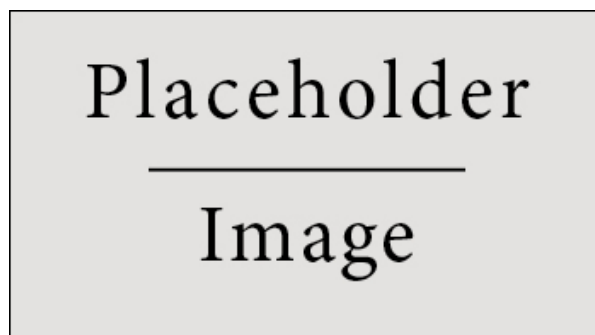
Figure 1: Figure caption.

The atomic weight of magnesium is concluded to be 24 \text{ g mol}^{-1} , as determined by the stoichiometry of its chemical combination with oxygen. This result is in agreement with the accepted value.