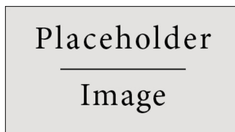
Figure 3.1: Figure caption